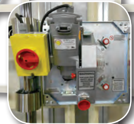
Worm Drive Motor