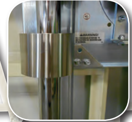
Double Bearings with Cover