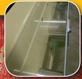
Aluminum Wheels vs. Plastic

—Les Leet, Keystone Tool and Dye, Westons Mills, NY