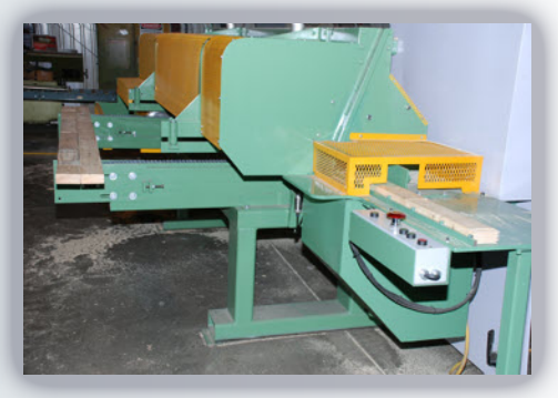
After being pressed, the hydraulic press will cut your lumber to either 8' or 9' lengths with it's built in Trim Saw