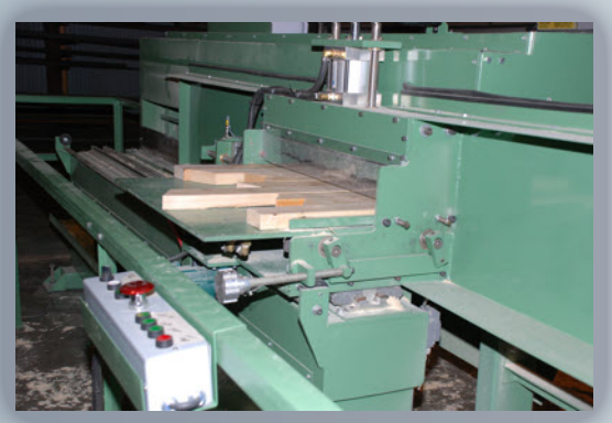
The Shaping Unit can shape up to nine boards in one pass

Wasserman & Associates along with Monet DeSauw have developed the only finger jointing system specifically designed and built for the Wood Component Manufacturing Industry. Turn your wood scrap (2x4 & 2x6) into profit with a positive impact on the environment. Eliminate waste as short as 8" in length and produce saleable studs up to 9' in length. Features include: Shaper with Cut-Off Saw, Glue System, 10' Hydraulic Press with a Trim Saw for 8' & 9' lengths, Installation & Training.