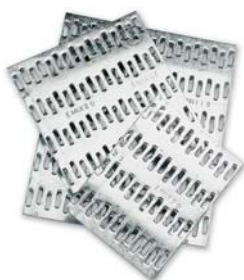
Eagle Structural Connector Plates

Increase your production quality and efficiency with Eagle's walk-through truss system.