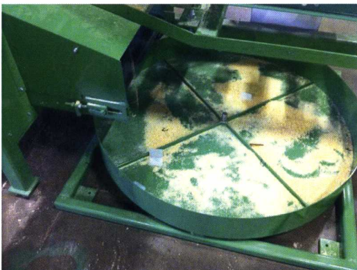
Small pieces delivered to the catch pan

“...NEARLY 1/2 THE PRICE OF THE COMPETITION YET COMPARABLE BOARD FOOTAGE...”