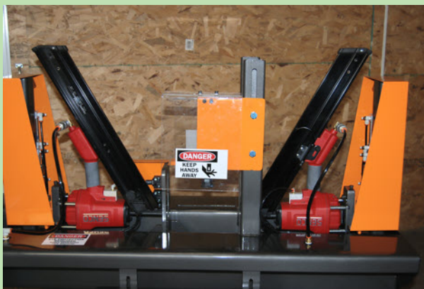
2 Gun Simple Design